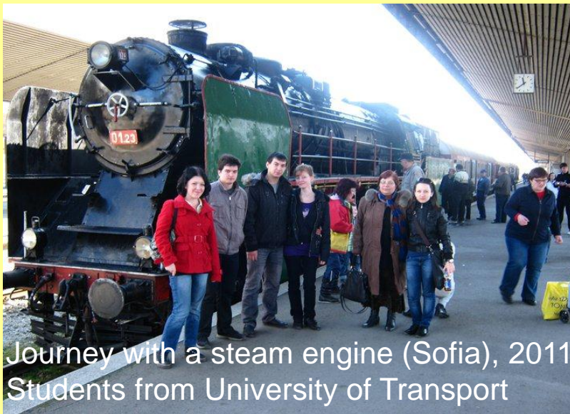
Journey with a steam engine (Sofia), 2011 Students from University of Transport