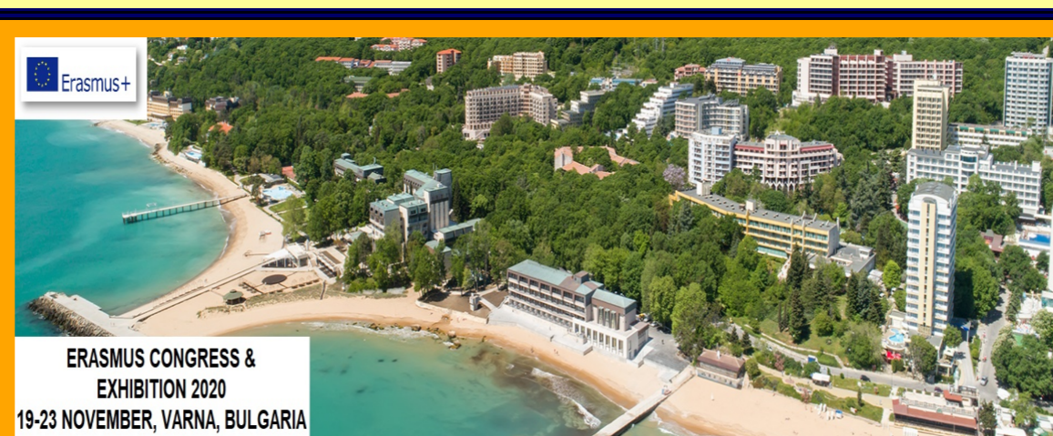
ERASMUS CONGRESS & EXHIBITION 2020 19-23 NOVEMBER, VARNA, BULGARIA

The Event is set under the patronage of Dr. Mariya Gabriel, EU Commissioner for Innovation, Research, Culture, Education and Youth